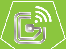
Ultra High Frequency RFID Transponder